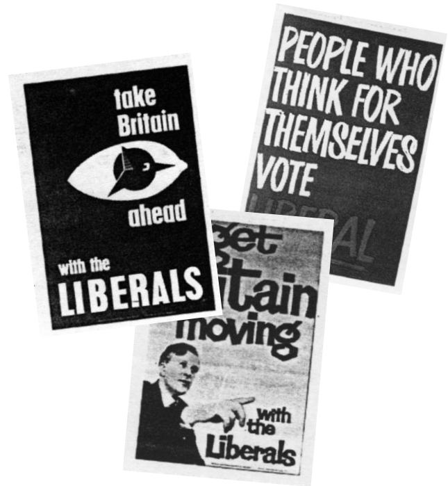
Liberal election posters from the 1964 election.