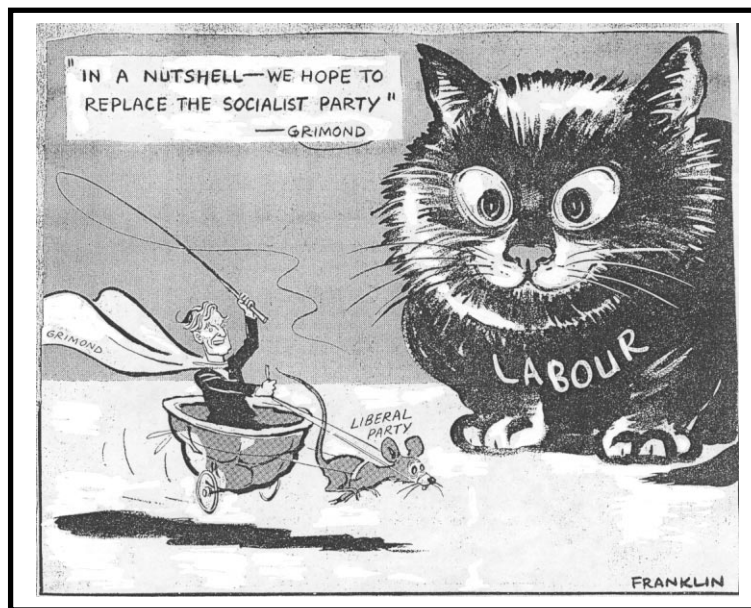
'THE NUTSHELL KING' Daily Mirror , 11 April 1959

Although an inspiration to many Liberals, some of whom still call themselves Grimondites, there was a persistent criticism that a small third party needed a brasher touch from its leader. He was a politician dedicated to the decencies who played the political game according to the traditional rules. The Liberals' prospect of political advance was held back by the inhibitions that their approach to politics imposed upon their activities. His leadership was therefore flawed. As a promoter of ideas there were few better, for he gave the party a clear vision of the kind of society he wanted, but the strategy of how to achieve it was less clearly marked out. For Grimond's political persona was paradoxical. Although he was an extremely popular politician both within and outside his party, nevertheless