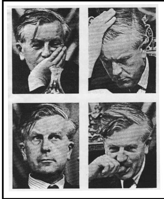
Jo Grimond, Liberal leader at the time of the Orpington byelection.

in Montgomeryshire seemed to confirm the trend. Punch made a Liberal cabinet out of six MPs. In practical terms, the result was a powerful demonstration of the effectiveness of tactical voting. 'Brothers, we're on our way,' George Brown told Labour voters in Orpington, but most of them realised then, and since, that the only way of defeating the Tories was for Labour and Liberal voters to support the strongest challenger. The British political system may treat any discussion of agreements between parties as unfit for polite conversation, but the lesson of Orpington may be that the people know better how to achieve the results they want.