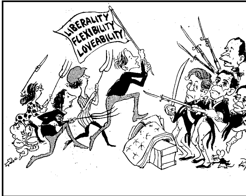
Young Liberals as the press saw them; the cover of the Guardian report on the Liberal Assembly, 1966.

Ultimately, however, the YL strategy did not prove a credible political alternative for the party, as it did not establish solutions in the long term for the issues with which the electorate were most concerned, such as