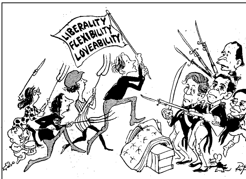
Young Liberals as the press saw them: the cover of the Guardian report on the Liberal Assembly, 1966.