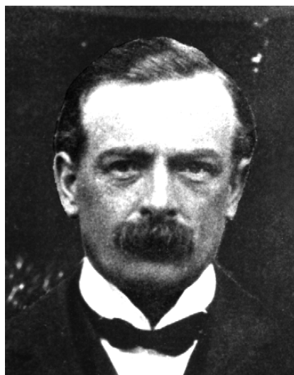
David Lloyd George