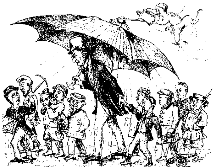
The Liberal leadership sheltering under the Gladstonian umbrella. Chamberlain is forging ahead with the Unauthorised Programme. Hartington, holding Gladstone's hand, is dragging his heels while John Bright brings up the rear.

Who knows what would have happened if Liberal nerves had held but, in the critical period between the election results in November 1885 and the meeting of the House in January 1886, the course of history was transformed by some ill-omened spin doctoring. In December, Gladstone's son Herbert, apparently concerned by fears of Chamberlain's rivalry to his father, briefed the press on his father's conversion to Home Rule. 34