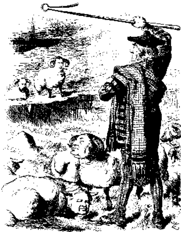
CALLING THEM HOME.

Chamberlain and Hartington resisting the summons of Gladstone at the end of the 1885 election campaign.