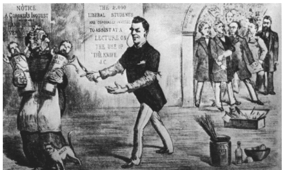
Chamberlain gains the backing of his local, Birmingham, party to butcher Gladstone's Irish bills.

Gladstone was never an enthusiast for party meetings and it is a measure of the government's desperation that he was persuaded to address a meeting at the Foreign Office on 27 May. The invitation was extended to those 'in favour of the establishment of a legislative body in Dublin for the management of affairs specifically and exclusively Irish' 48 — discouraging to hard-line opponents but flexible to waverers. 260 responded. The conciliatory tone, effectively killing land reform while keeping