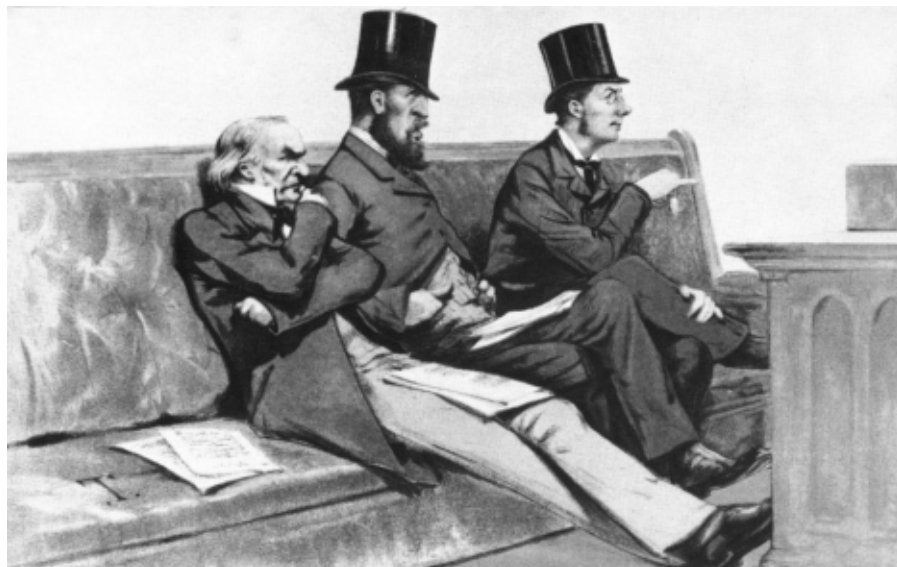
Originally captioned 'Brains, Birth and Brummagen', this caricature shows Gladstone, Hartington and Chamberlain on the government front bench before the great divide.