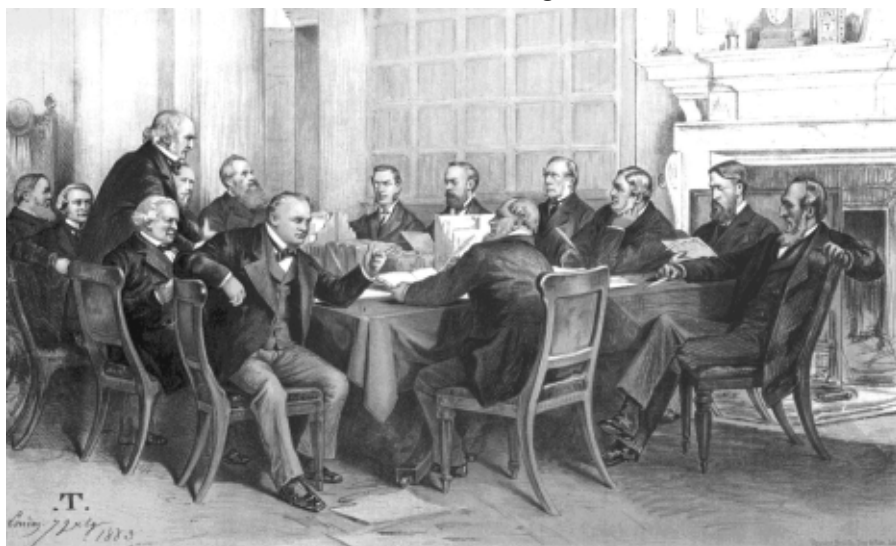
Gladstone addresses the cabinet in 1883, a rather fanciful artist's impression. Chamberlain is recognisable by his monocle, near the pillar. Hartington is second from the right with Harcourt to his right.

Chamberlain and Hartington were of a younger generation, both in their early fifties in 1886. Lord Hartington was heir to the Duke of Devonshire, one of the largest landowners in the country. Known for his keen interest in horse racing, 11 he enjoyed a full social life, mixing with the Marlborough House set surrounding the Prince of Wales. He conveyed the impression that his involvement in politics was purely noblesse oblige , for which he had to endure endless ennui. However, Reginald Brett, his former secretary, later Lord Esher, made it clear that 'apart from politics he has no real interest in life; and cut off from them