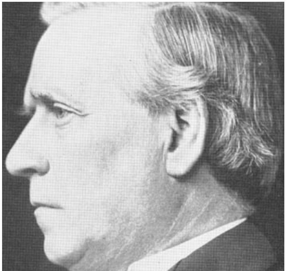
Herbert Henry Asquith (1852–1928)

He was overwhelmingly right on the issue. There was no other way that the albatross of the Irish problem could be cut from the neck of British politics. But he was not good at presenting this dramatic change of position to his major colleagues. As a result he lost two of them, Hartington, later Duke of Devonshire, from the right of the party and Joseph Chamberlain from the left, while the loyalty of several others was