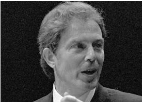
Tony Blair – anything of the British Liberal tradition?

future Liberal government perished in the 1920s; but this did not mean that the influence of liberalism disappeared from British politics. Baldwin was a liberal Tory prime minister in the 1920s and 1930s. So was Macmillan in the 1950s. There were considerable liberal influences in both the Labour and Conservative parties – but few Liberal parliamentary seats. In 1983, after new strength was injected into the old Liberal Party through its amalgamation with the short-lived but powerful catalyst the Social Democratic Party, the new alliance got 26 per cent of the popular vote but only 3.5 per cent of the seats.