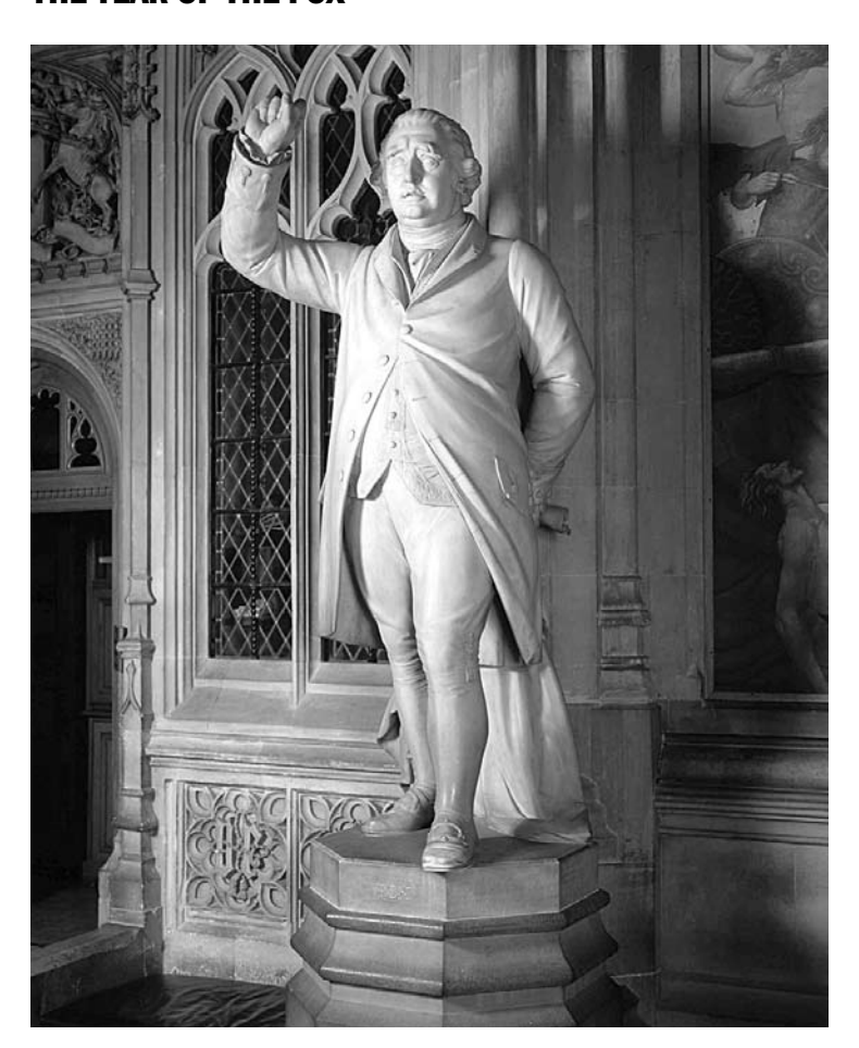
Figure 10. Statue of Fox by EH Bailey RA. © Palace of Westminster.

memorials. English Heritage's involvement with the London Borough of Camden in the restoration of Bloomsbury Square, including the associated work to assist the public visibility of Westmacott's statue of Fox, is very welcome. Some further works of tree pruning are to be undertaken, but money also needs to be raised to clean the statue.