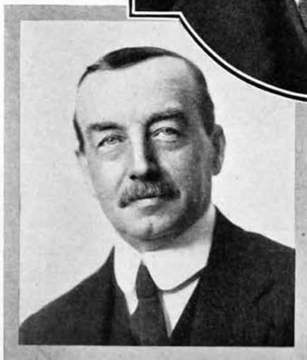
MR. ARTHUR HENDERSON.