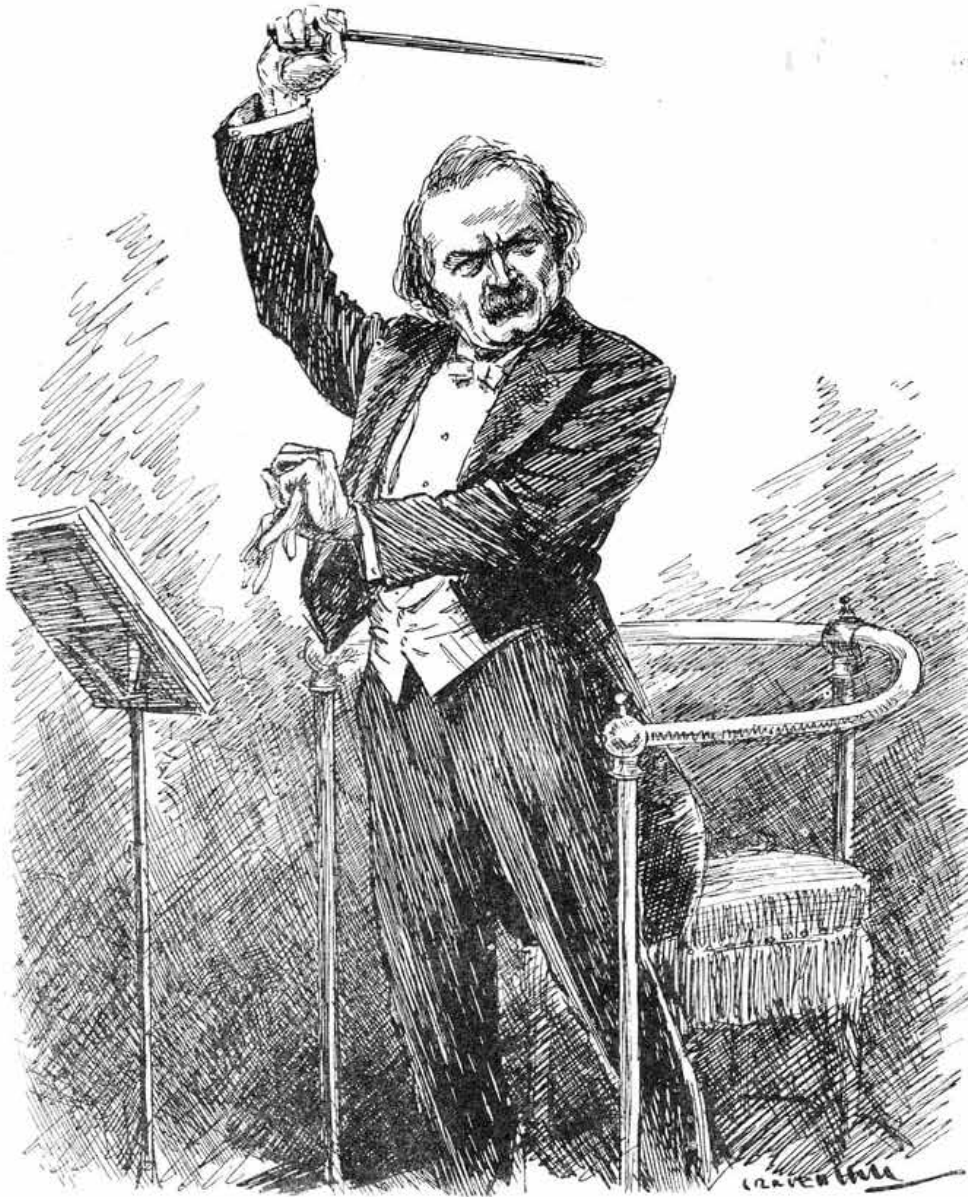
THE NEW CONDUCTOR. OPENING OF THE 1917 OVERTURE.