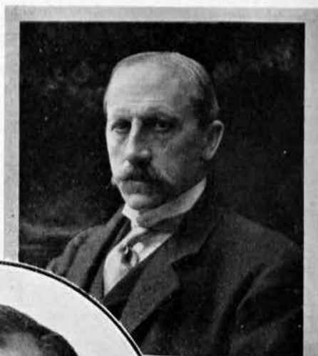
VISCOUNT MILNER.