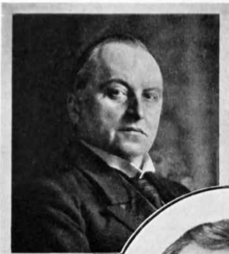
EARL CURZON.