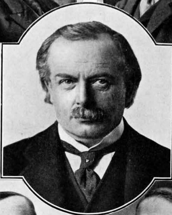
MR. LLOYD GEORGE.